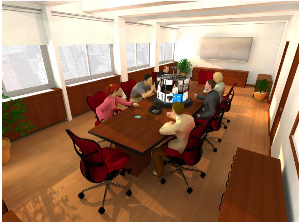
Figure 1. uCollaborator Simulated Prototype.