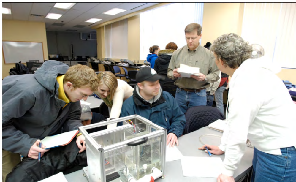
Figure 2. Typical CHAPL classroom, with students gathered around a DLM while the instructor observes and interjects where needed to guide or correct the students' understanding.